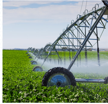
Energy efficient pumps for irrigation and cooling systems