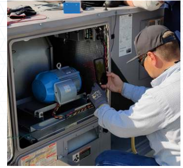
General purpose HVAC