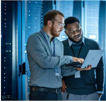
Smart HVAC for data centers