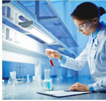
Mission critical cooling systems for labs